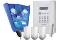
i-on Compact PSTN Kit