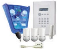
i-on Compact WiFi Kit