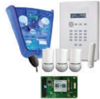
i-on Compact GSM Kit