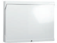
Menvier 30KPZ & Menvier 40KPZ & Menvier 100KPZ & Menvier 1000KPZ