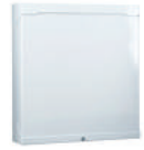
i-on30EXDKP & i-on50EXDKP & i-on160EXKP & i-on1000EXKP