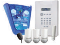
i-on Compact Audible Kit