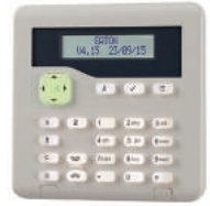
KEY-RKPZ & KEY-K01 & KEY-KP01 & KEY KPZ01 & KEY-FKPZ