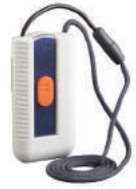
701 & 702